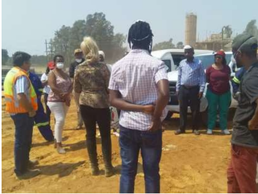
Sand Dump 20