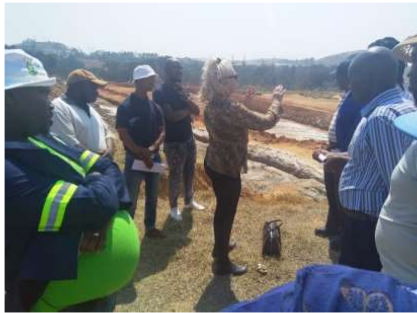
Lancaster Dam (Mintails)