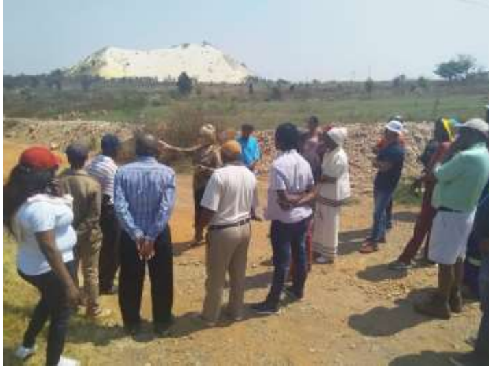
Pipeline and North Sands Dump (Mintails)