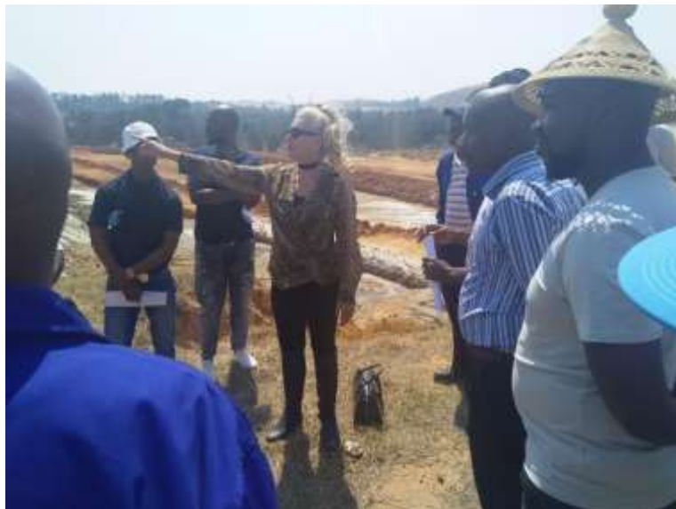
Lancaster Dam (Mintails)