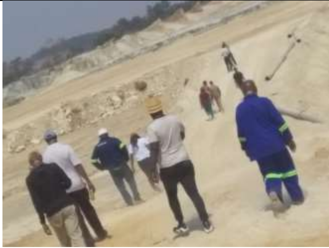
Millsite Complex – Reclamation Operations