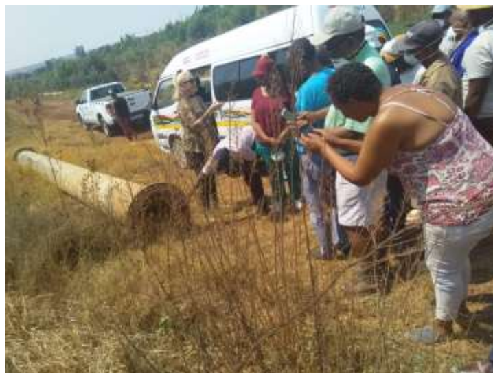
Millsite Complex – Reclamation Operations