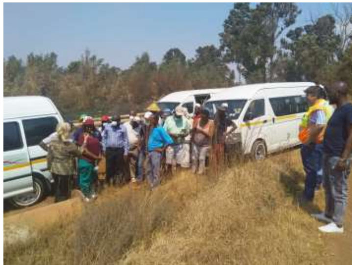
Millsite Complex – Reclamation Operations