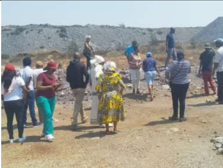
Monarch Pit (Mintails)