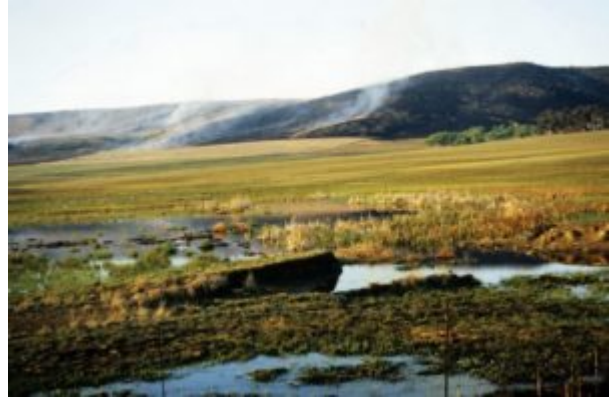
Montane grassland in the Mabola Protected Environment

Today, the North Gauteng High Court set aside the 2016 decisions of former Mineral Resources Minister Zwane and the late Environmental Affairs Minister Molewa to permit a new coal mine to be developed in the Mabola Protected Environment near Wakkerstroom, Mpumalanga.